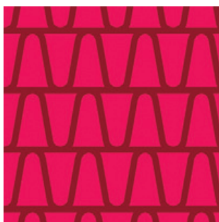
Patented HoneyCombe® wheel design provides a vast surface area for desiccant.

By optimizing the rotor design and reactivation circuit, Munters has improved the energy efficiency by 10-15% over standard desiccant dehumidifier systems.